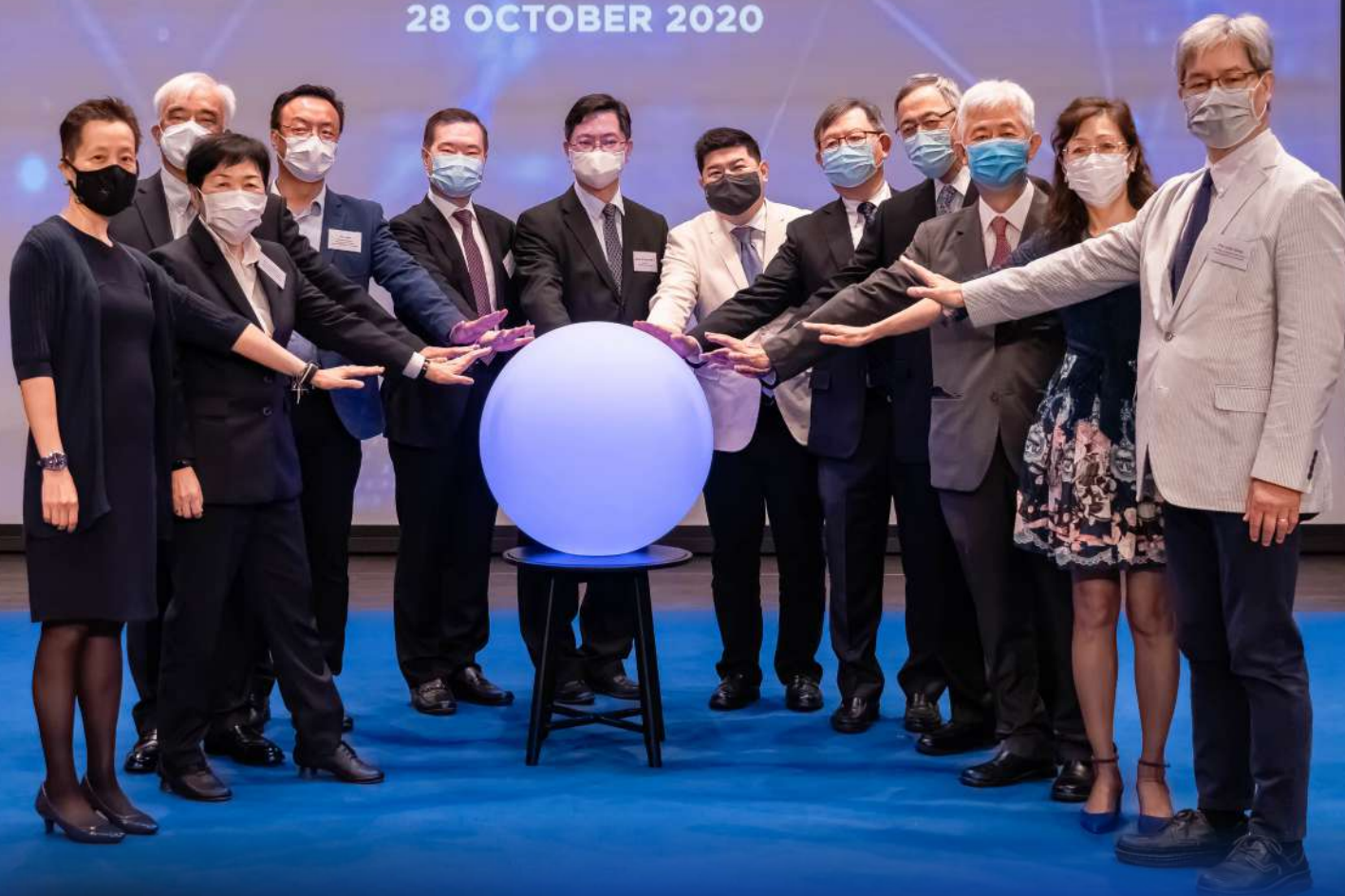
The opening ceremony of iFREE GROUP Innovation & Research Centre